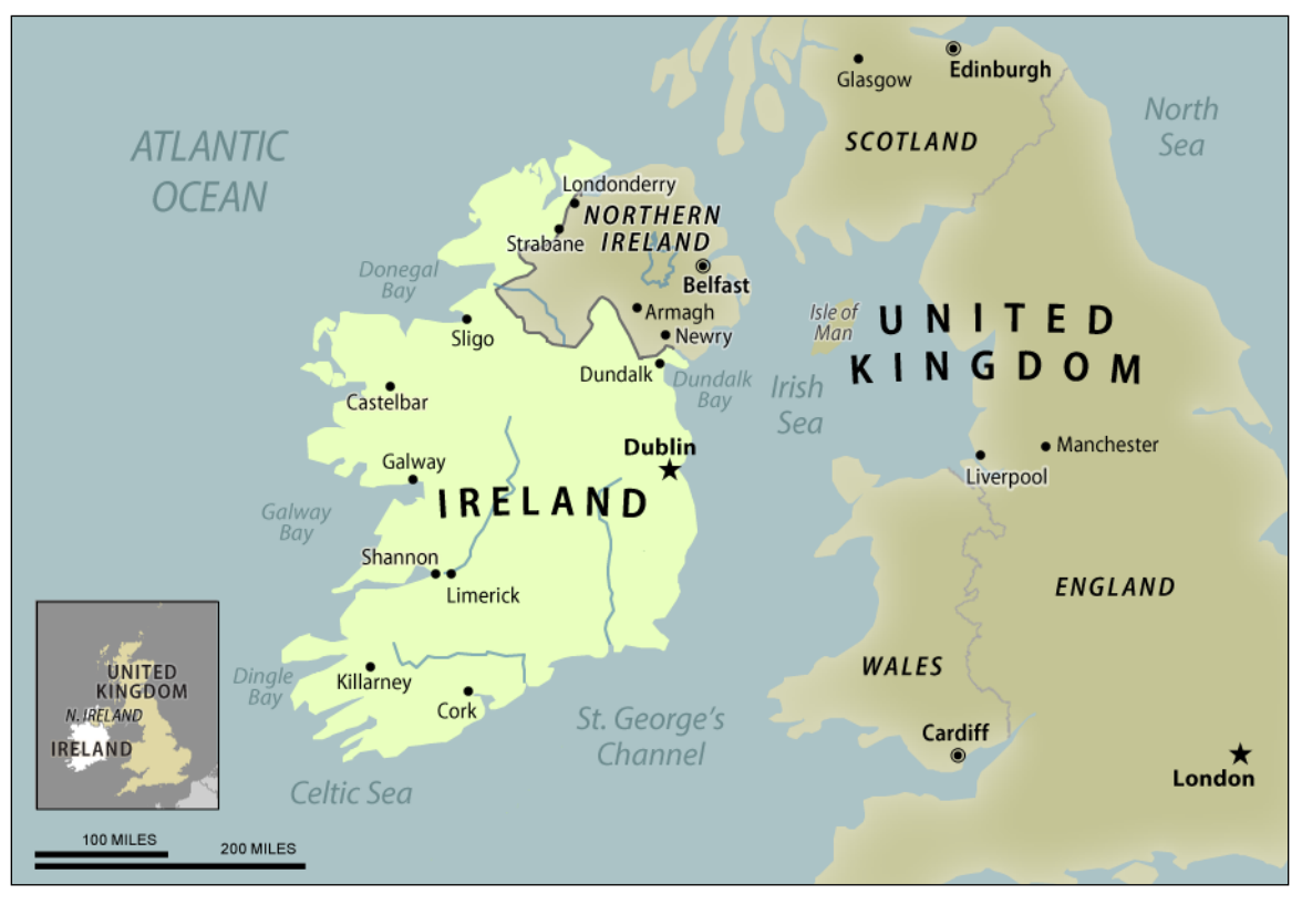
Figure 2. Map of Northern Ireland (UK) and the Republic of Ireland

devolved government and Brexit. Violence has been directed in particular at police officers (long regarded by dissident republicans as legitimate targets), and several failed bombings were attempted in border areas (especially Londonderry/Derry, a key flashpoint during the Troubles).<sup>62</sup>