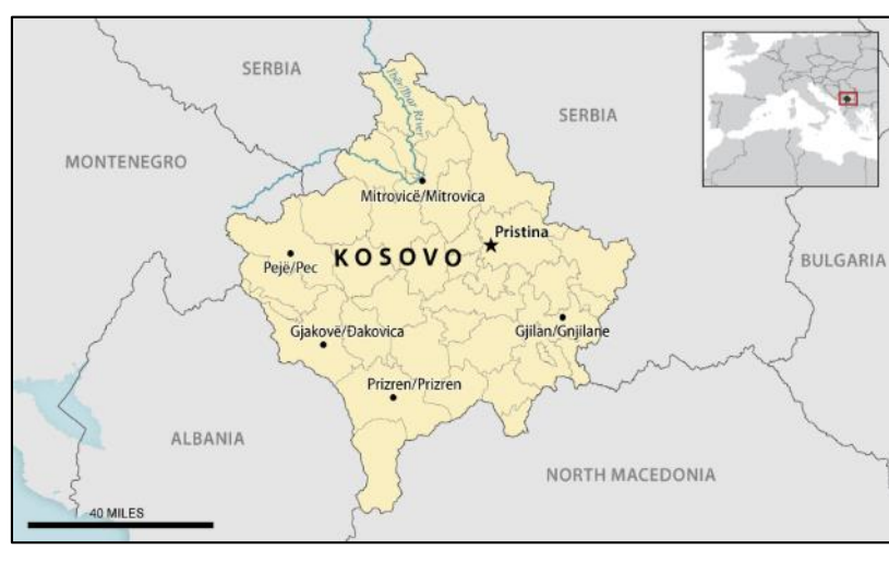
Figure 1. Republic of Kosovo

Kosovo is a parliamentary democracy with a prime minister, who serves as head of government, and an indirectly elected president, who serves as head of state. The unicameral National Assembly has 120 seats, of which 10 are reserved for Serbs and 10 are reserved for other minorities. Longtime Vetëvendosje leader Albin Kurti became prime minister for the second time on March 22, 2021, just one year after his first short-lived government collapsed. The National Assembly elected Vetëvendosje-backed candidate Vjosa Osmani as president on April 4, 2021.