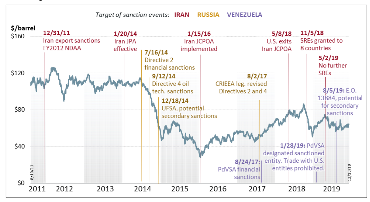
Figure 4. Brent Crude Oil Price and Selected Oil-Related Sanction Events

economic and oil demand growth forecasts, supply growth in certain countries, OPEC oil production decisions, and other physical and financial market variables.