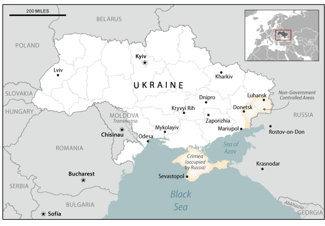
Figure 2. Ukraine

occupied Crimea. Russia interferes with commercial traffic traveling to and from Ukrainian ports on the Sea of Azov in Mariupol and Berdyansk, which export steel, grain, and coal. <sup>87</sup> Russia also has bolstered its maritime forces in the Sea of Azov. In November 2018, Russia forcibly prevented Ukrainian naval vessels from passing through the Kerch Strait to reach Ukrainian shores and illegally detained 24 crew members for 10 months. <sup>88</sup>