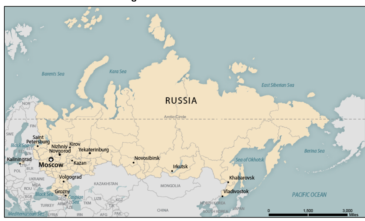
Figure 1. Russian Federation

Although competition can incentivize initiative and risk-taking, it also can contribute to uncoordinated and duplicated intelligence efforts. Competition has led to the ousting of agency leaders, the creation of new agencies, and even the total dissolution of agencies. Competition sometimes is factional, defined by personal relationships, or crosses organizational lines in pursuit of opportunities for enrichment and political advancement. It also has led to temporary or issue-specific cooperation between agencies, which occasionally unite to prevent or deny another agency from gaining too much power or influence.<sup>22</sup> Competition also reportedly results in agencies providing intelligence that confirms policymakers' worldviews instead of accurate, if inconvenient, information.<sup>23</sup>