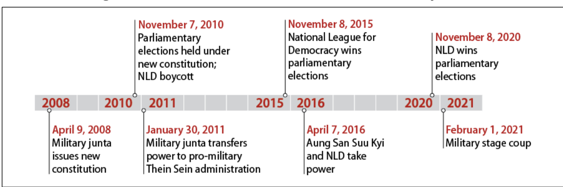
Figure 2. Burma's Political Transition: 2008–February 2021

Before the coup, Burma had undergone substantial political transition since 2008. That year, the military regime, then known as the State Peace and Development Council (SPDC), held a national referendum on a new constitution that would establish a hybrid civilian/military Union Government. Many observers viewed the results of the referendum—in which over 90% of the voters supported the new constitution—as fraudulent.<sup>51</sup> On November 7, 2010, the SPDC held parliamentary elections that were boycotted by many political parties, including Aung San Suu Kyi's National League for Democracy (NLD). The pro-military Union Solidarity and Development Party (USDP) won nearly 80% of the contested seats (under the 2008 constitution, 25% of the seats in Burma's Union Parliament are uncontested and instead appointed by the Commander in Chief of Defence Services). The new Union Parliament appointed SPDC Prime Minister Lieutenant General Thein Sein as President.