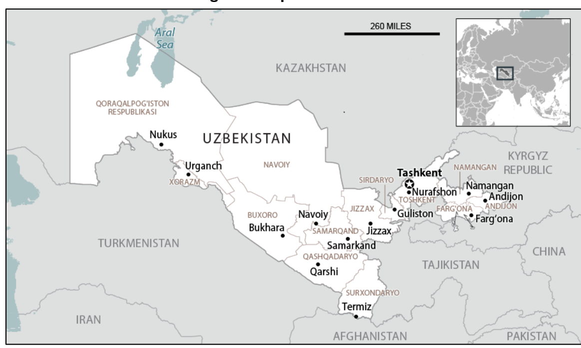
Figure 7. Map of Uzbekistan

7). The country also shares a border with Afghanistan. Uzbekistan is slightly larger than California, and the majority of the country's population of approximately 34.9 million is Uzbek (83.8%), with Tajik (4.8%), Kazakh (2.5%), Russian (2.3%), Karakalpak (2.2%), and Tatar (1.5%) minorities, among others. <sup>172</sup> Most of Uzbekistan's inhabitants are Muslim (88% according to U.S. government estimates, and 96% according to the government of Uzbekistan), almost exclusively Sunni, and about 2.2% of the population is Russian Orthodox. <sup>173</sup> The United States and Uzbekistan cooperate in addressing regional threats such as illegal narcotics, trafficking in persons, terrorism, and violent extremism. <sup>174</sup> Additionally, the wide-ranging reform effort currently underway in Uzbekistan potentially creates new opportunities for U.S. engagement with the country across a range of sectors. Uzbekistan previously had sought to position itself as an intermediary between the Taliban and the Afghan government, in line with Uzbekistan's stated aim of facilitating intra-Afghan peace talks. <sup>175</sup> Uzbekistan's stance toward the Taliban is generally seen as pragmatic, with the priority of ensuring Uzbekistan's security (see "Afghanistan," below). <sup>176</sup>