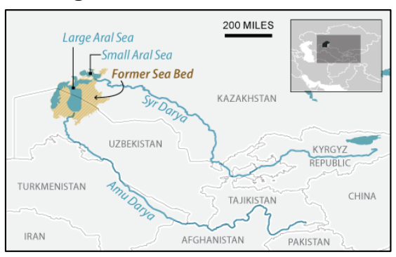
Figure 10. Aral Sea Watershed

Central Asia's water resources give some countries in the region significant hydropower potential, but they also serve as a potential source of conflict given downstream countries' dependence on the region's rivers for irrigation. Soviet-era irrigation projects that diverted large volumes of water for agricultural purposes from the Syr Darya and the Amu Darya, the region's two major rivers, led to the desiccation of the Aral Sea, once the world's fourth-largest lake, with environmental, economic, and public health consequences.<sup>248</sup> Today, the Syr Darya and the Amu Darya each cross multiple international borders: the Amu Darya