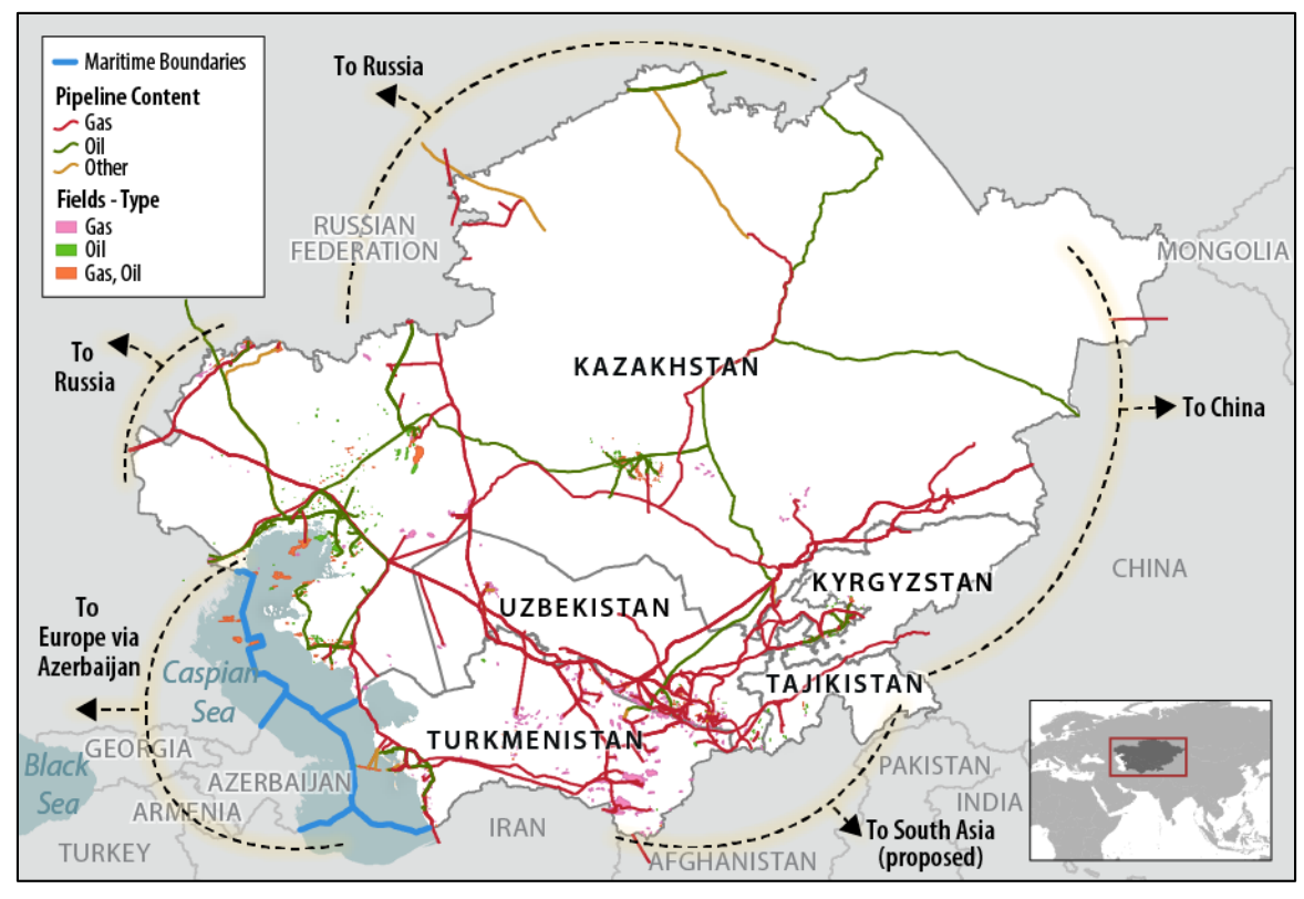
Figure 9. Oil and Gas in Central Asia