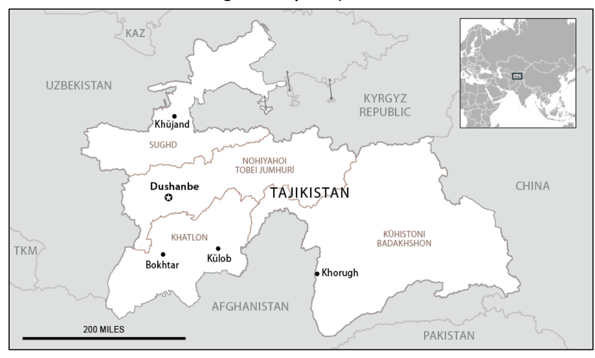
Figure 5. Map of Tajikistan