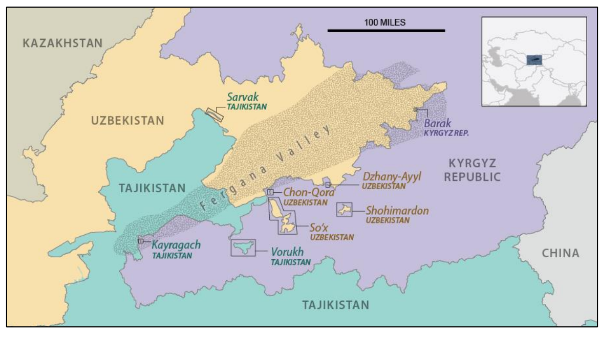
Figure 8. Exclaves in the Fergana Valley