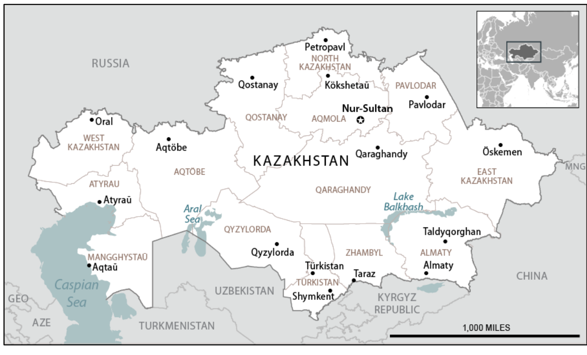
Figure 3. Map of Kazakhstan

Endowed with significant hydrocarbon and mineral resources, Kazakhstan is the most developed country in Central Asia. Kazakhstan shares lengthy borders with Russia to the north and China to the east, and also borders Kyrgyzstan, Uzbekistan, and Turkmenistan (see Figure 3 ); it is the world's ninth largest country by land area (about four times the size of Texas). The ethnically diverse population of approximately 19 million is predominantly Kazakh (69%), with minority groups including Russians (18.4%), Uzbeks (3.2%), Ukrainians (1.4%), Uyghurs (1.4%), and Tatars (1%), among others. About 70% of the population is Muslim, mostly Sunni, and approximately a quarter is Christian, primarily Russian Orthodox. Since independence, Kazakhstan's authoritarian government has introduced market reforms, developed the energy sector, and moved to diversify its economy. Kazakhstan pursues a "multi-vector" foreign policy, seeking to balance its relations with major powers while actively participating in international organizations.