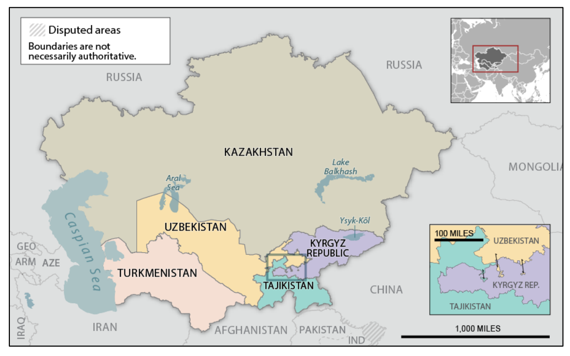
Figure I. Map of Central Asia