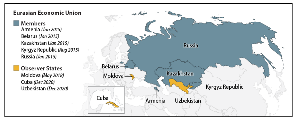
Figure 11. The Eurasian Economic Union