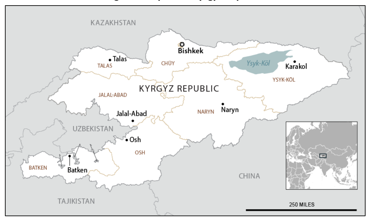
Figure 4. Map of the Kyrgyz Republic