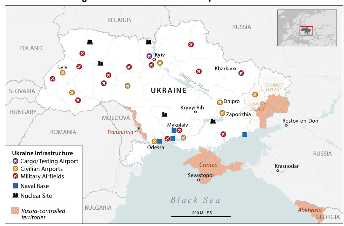
Figure 3. Ukraine Airfields and Key Infrastructure

brutal, general, Surovikin's goal was to stem Russian losses and stabilize the frontline. <sup>83</sup> To do so, Surovikin adopted a more defensive strategy, including the building of extensive, interlocking defensive lines across southern Ukraine. <sup>84</sup> Thousands of mobilized personnel were immediately sent to the frontlines, often with limited training and equipment. <sup>85</sup> Despite their poor quality, these fresh troops allowed Russia to reinforce its lines, and in some cases even rotate and rest units. The commander of Ukraine's armed forces, General Valery Zaluzhny, stated bluntly, "Russian mobilization has worked. It is not true that their problems are so dire that these people will not fight. They will." <sup>86</sup>