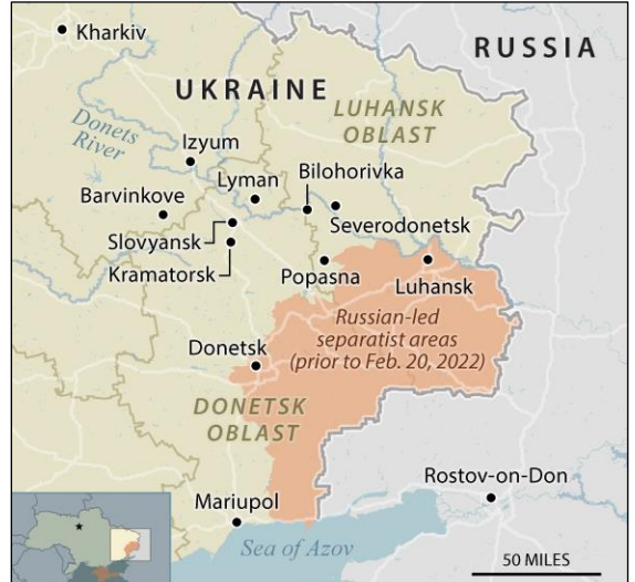
Figure 2. Donbas Region of Ukraine