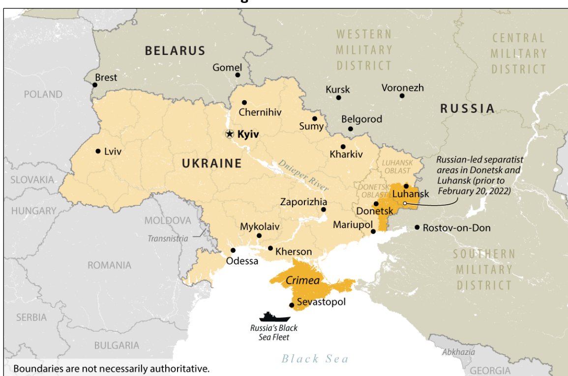
Figure I. Ukraine

On February 24—following months of warning and concern from the Biden Administration, European allies, NATO, and some Members of Congress—Russia launched a full-scale invasion of Ukraine. Russia claimed its invasion was to conduct a "special military operation" to protect the civilian population and to "demilitarize" and "de-Nazify" Ukraine; observers generally understood the latter term as a false pretext for overthrowing the democratically elected Ukrainian government.<sup>11</sup>