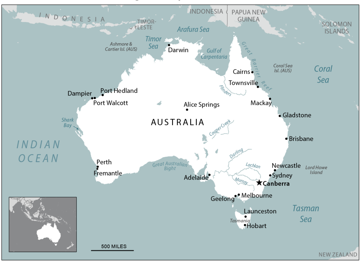
Figure 2. Map of Australia