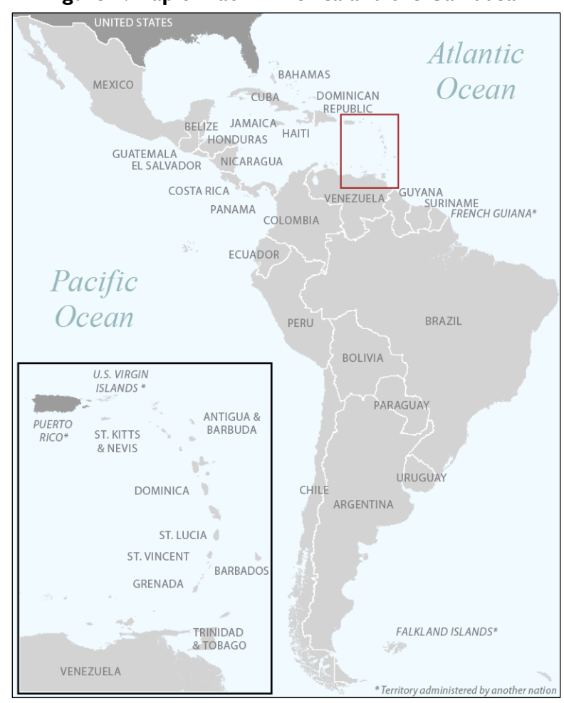
Figure 1. Map of Latin America and the Caribbean

Foreign assistance (also referred to as foreign aid in this report) is one of the tools the United States employs to advance U.S. interests and policy goals in Latin America and the Caribbean.<sup>1</sup> Current aid programs reflect the diverse needs of countries in the region, as well as the broad range of these countries' ties to the United States (see Figure 1 for a map of Latin America and the Caribbean). Some countries receive U.S. assistance across many sectors to address political, socioeconomic, and security challenges. Others have made major strides in consolidating democratic governance and improving living conditions; these countries no longer receive traditional U.S. development assistance but typically receive some U.S. support to address shared security challenges, such as transnational crime. Congress authorizes and appropriates foreign assistance funds for Latin America and the Caribbean and conducts oversight of aid programs and the executive branch agencies that allocate, program, and administer them.