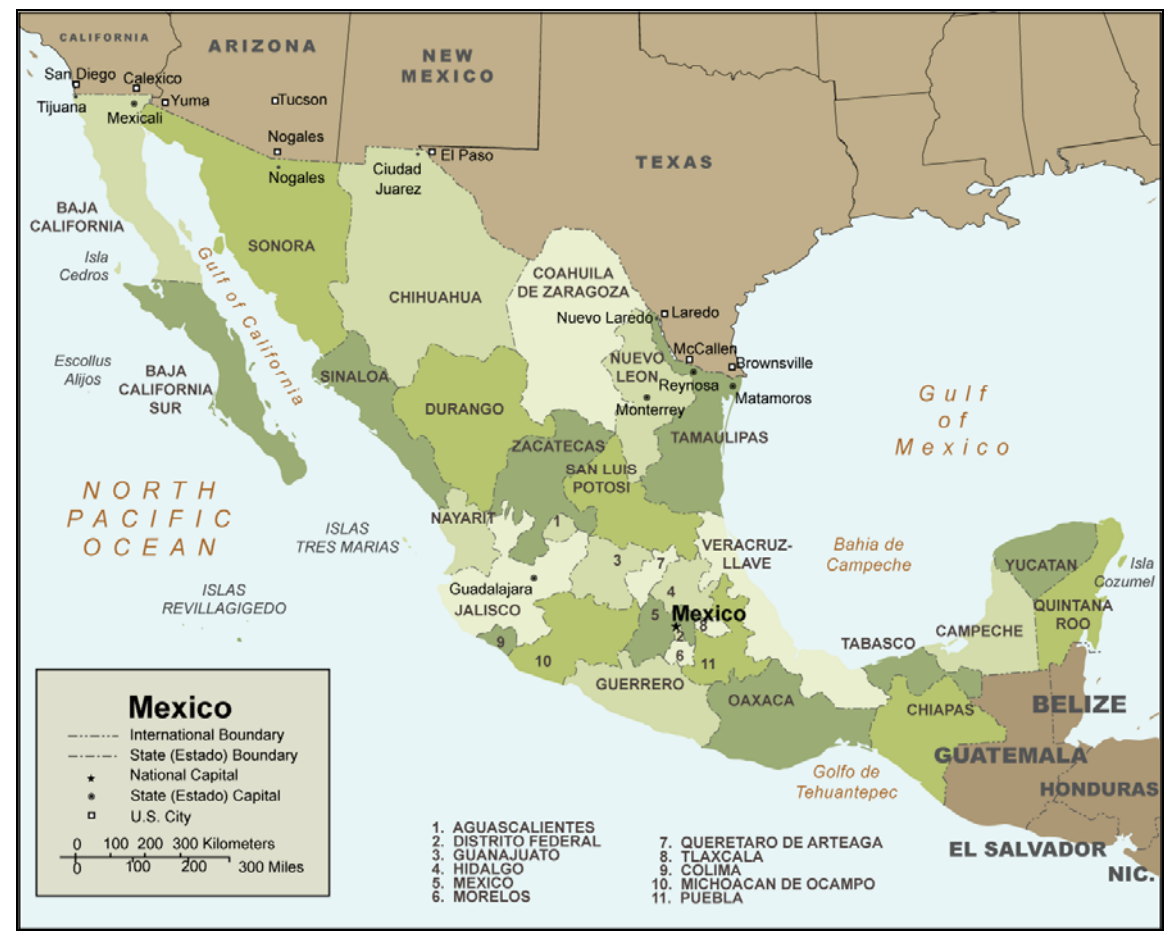
Figure 1. Map of Mexico, Including States and Border Cities

Over the past two decades, Mexico has transitioned from a centralized political system dominated by the Institutional Revolutionary Party (PRI) to a true multiparty democracy. Since the PRI last governed in the 1990s, presidential power has become increasingly constrained by Mexico's Congress, its Supreme Court, and increasingly powerful governors. Partially as a result of those constraints, two successive National Action Party (PAN) administrations struggled to enact the structural reforms needed to boost Mexico's economic competitiveness and effectively address the country's security challenges. Weak institutions remain an impediment to democratic consolidation in Mexico.