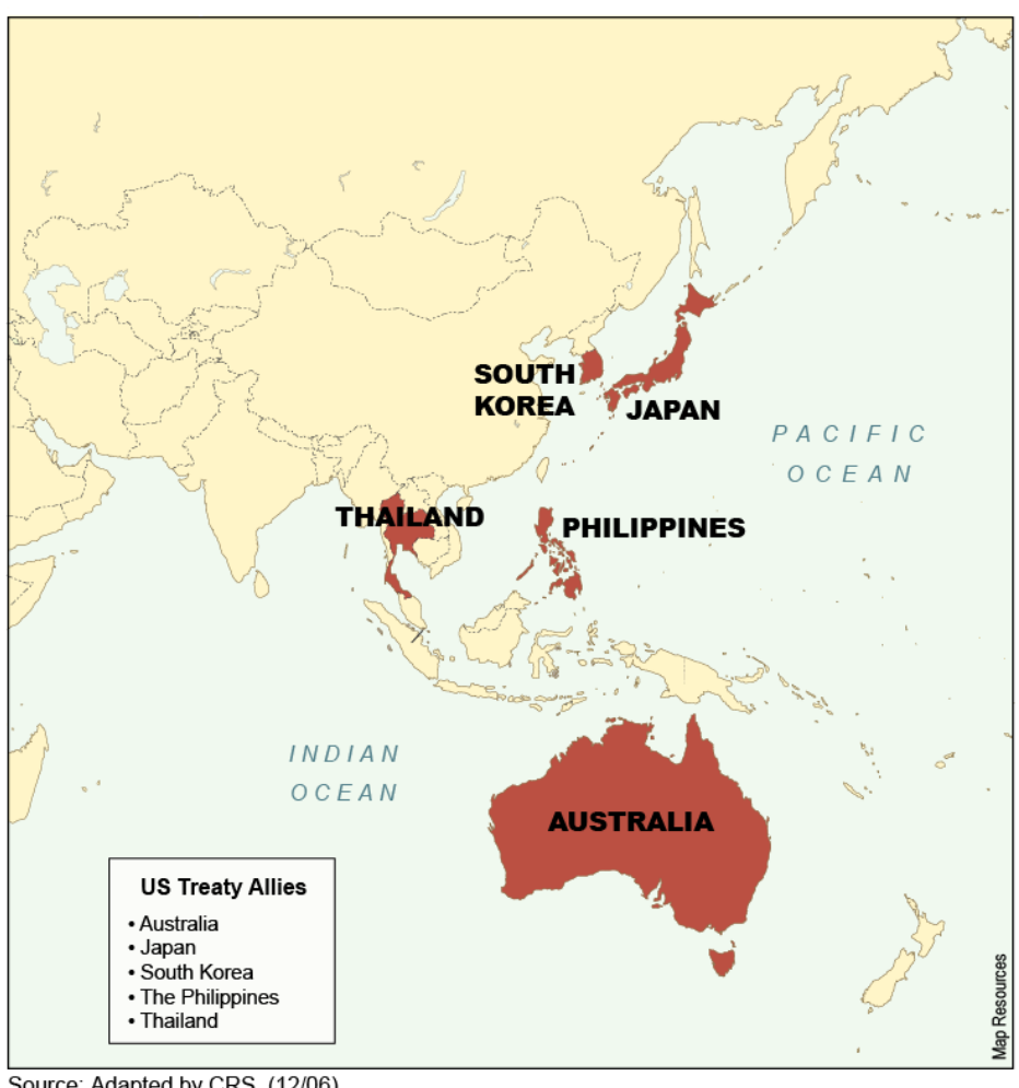
Figure 3. The United States Treaty Allies in Asia

Thailand is viewed as seeking to balance its American relationship with one with China; New Zealand was de facto dropped from the Australia-New Zealand-United States (ANZUS) alliance in the mid 1980s; poor relations with the Philippines led the United States to leave its military bases there in 1992 and there are signs of emerging differences in the U.S.-Republic of Korea relationship. Despite these developments, the system has endured because the correlates of power in post war Asia have not "altered in a way that suggests that the United States is not a useful balancer of last resort."53 Figure 3 shows the locations of the United States' regional allies.