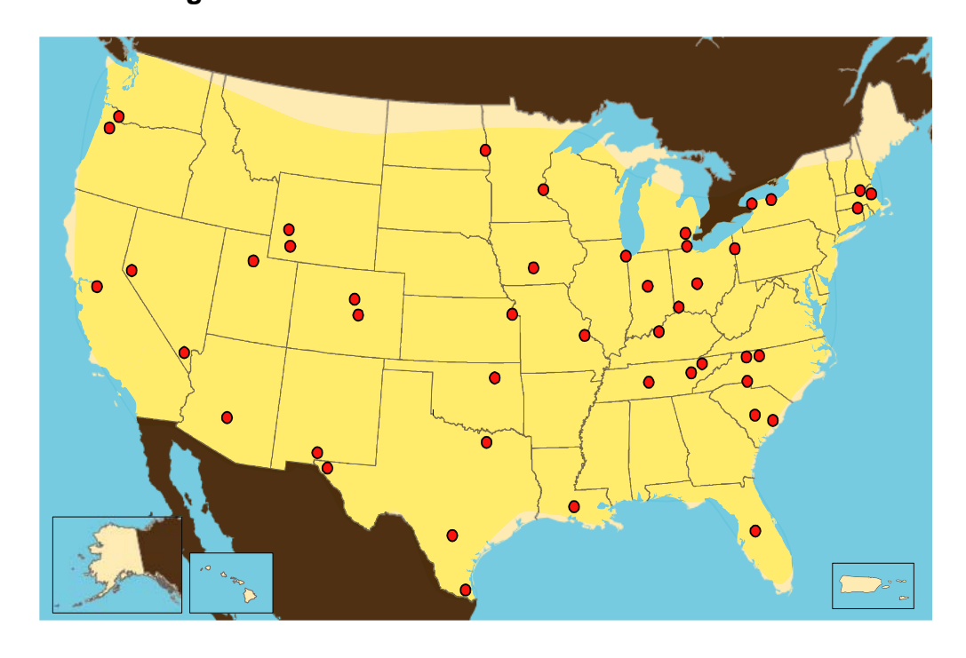
Figure 3. Mexican Cartel Presence in the United States

Mexican cartels also produce methamphetamine and marijuana in the United States. Mexican cartels have long grown marijuana in the United States, often on federal land in California, but they are now expanding production to the Pacific northwest and, to a lesser extent, the eastern United States. (See Figure 3 ). Mexican marijuana producers in California, the Pacific northwest, and eastern United States are increasingly linked to each other and "[m]any of these groups maintain their affiliation with the larger groups in California and Mexico and maintain some level of coordination and cooperation among their various operating areas, moving labor and materials to the various sites — even across the country — as needed."<sup>14</sup>