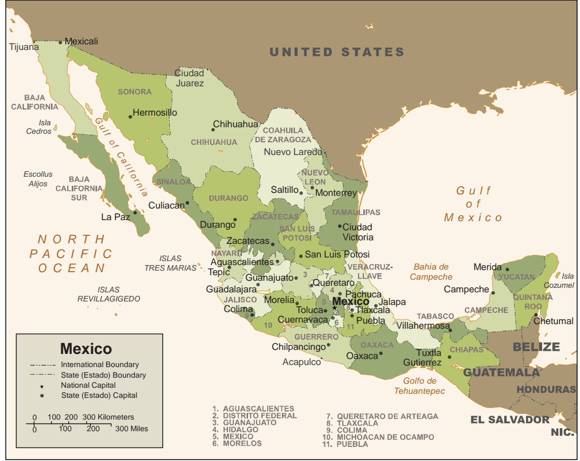
Figure 1. Map of Mexico

organization, and mounting violence, are the result of Mexico's success in capturing cartel leadership.