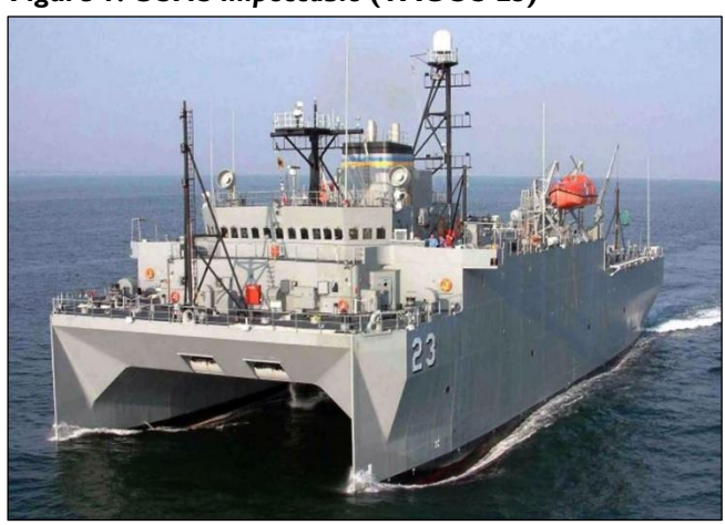
Figure 1. USNS Impeccable (TAGOS-23)