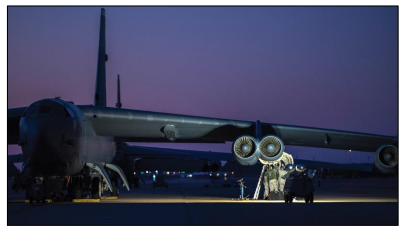
Figure 1. Engine Mounting on B-52

The Air Force currently operates 76 B-52Hs, the most recent of which was built in the 1960s. The Air Force now expects to operate them until 2050. The last TF33 engine was built in 1985. (For more on the B-52 fleet, see CRS Report R43049, U.S. Air Force Bomber Sustainment and Modernization: Background and Issues for Congress. )