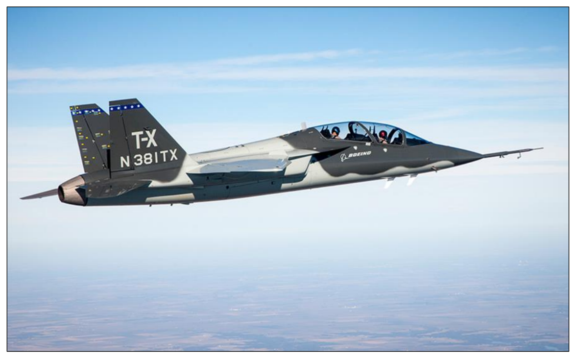
Figure 7. Boeing-Saab T-X

In December 2013, Boeing and Saab formed a partnership to develop a purpose-built trainer in anticipation of the USAF APT program. The single-engine, twin-tail, stadium seating trainer was unveiled on September 13, 2016, at Boeing's St. Louis, MO, facility. According to Boeing, the T-X (see Figure 7 ) is a production aircraft and not a prototype. As of December 2016, two T-X aircraft had already flown maiden flights. <sup>44</sup> Boeing claims the purpose-built trainer was designed from the ground up to include the Ground-Based Training System and support. Parts of the aircraft were manufactured in Sweden and final assembly took place in St. Louis, MO. <sup>45</sup>