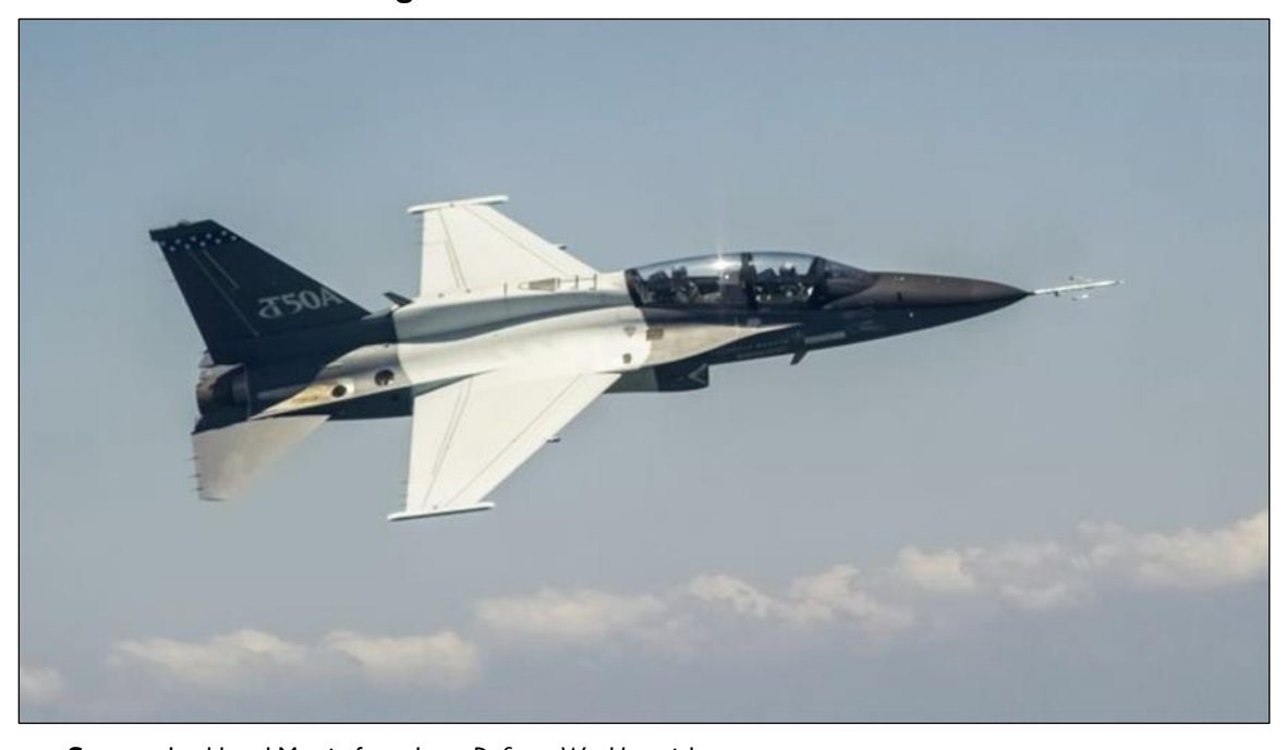
Figure 9. Lockheed Martin-KAIT-50A

training, open system architecture, and a fifth-generation cockpit.<sup>51</sup> The T-50 aircraft was designed by KAI and LM in 2002 and is used as a trainer in Korea, Indonesia, Thailand, the Philippines, and Iraq.<sup>52</sup>