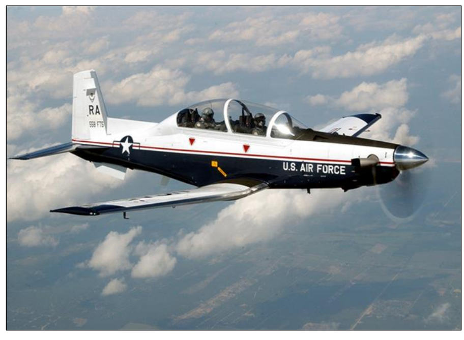
Figure 1.T-6A Texan II