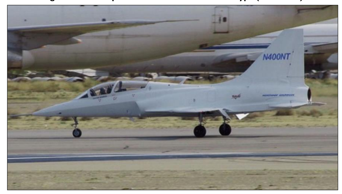
Figure 8. Northrop Grumman/BAE/L-3 T-X Prototype (Model 400)

In August 2016, a single-engine, single-tail, two-seat T-X prototype was seen performing high-speed taxi tests at the Mojave Air and Space Port in California (see Figure 8 ).<sup>47</sup> The aircraft bore the logos of Northrop Grumman and its subsidiary, Scaled Composites; it was subsequently known to have the designation Model 400 Swift.<sup>48</sup> According to aerospace analysts, the design resembled the Northrop T-38C it was intended to replace.<sup>49</sup> On February 1, 2017, Defense News reported that Northrop Grumman-BAE-L3 had decided not to enter the competition for the T-X contract "as it would not be in the best interest of the companies and their shareholders."<sup>50</sup>