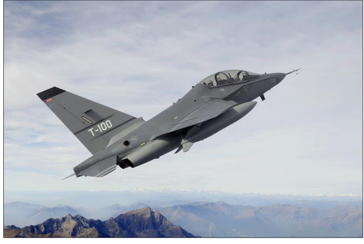
Figure 10. Leonardo T-100