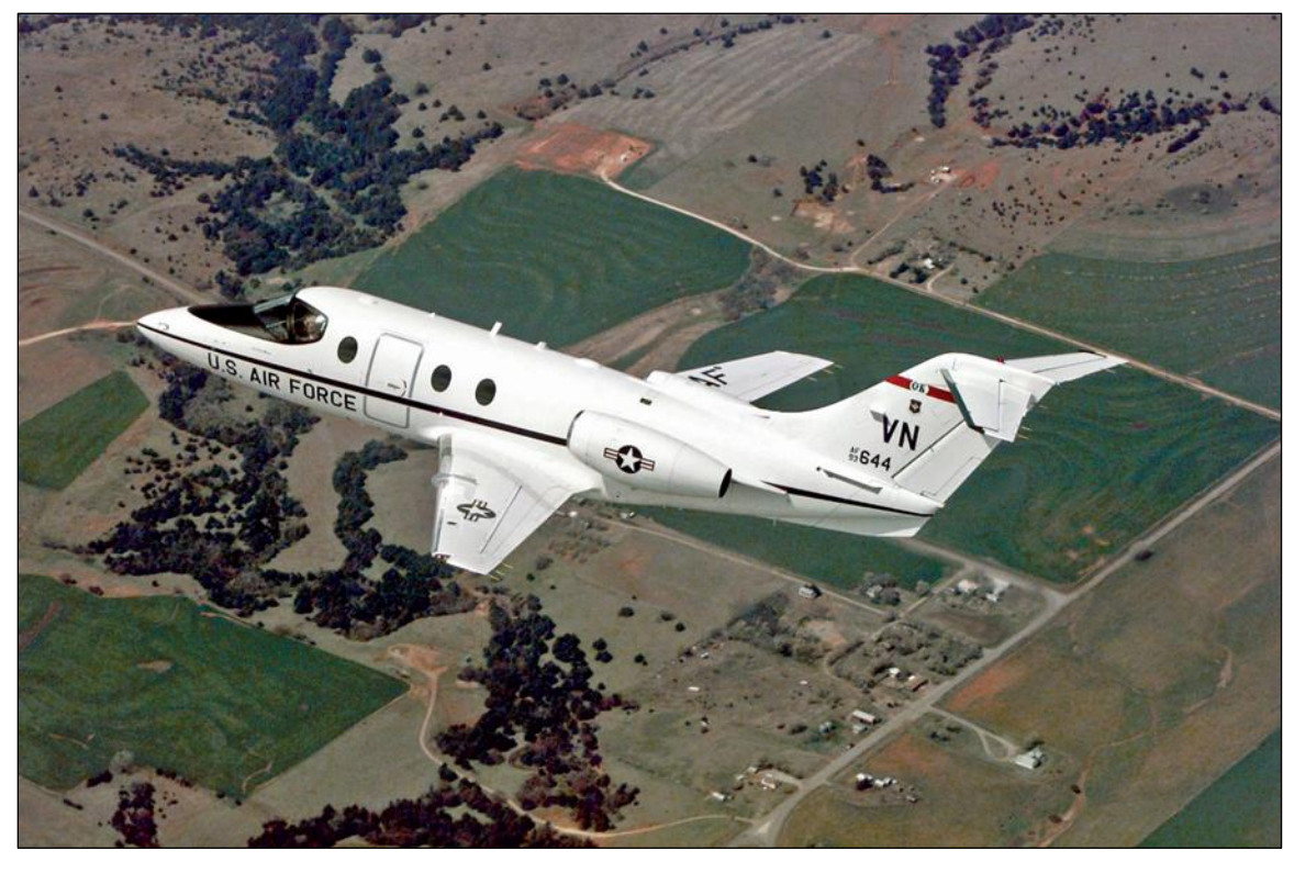
Figure 2.T-IA Jayhawk