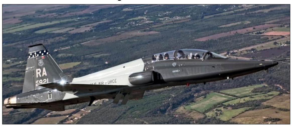
Figure 4.T-38C Talon