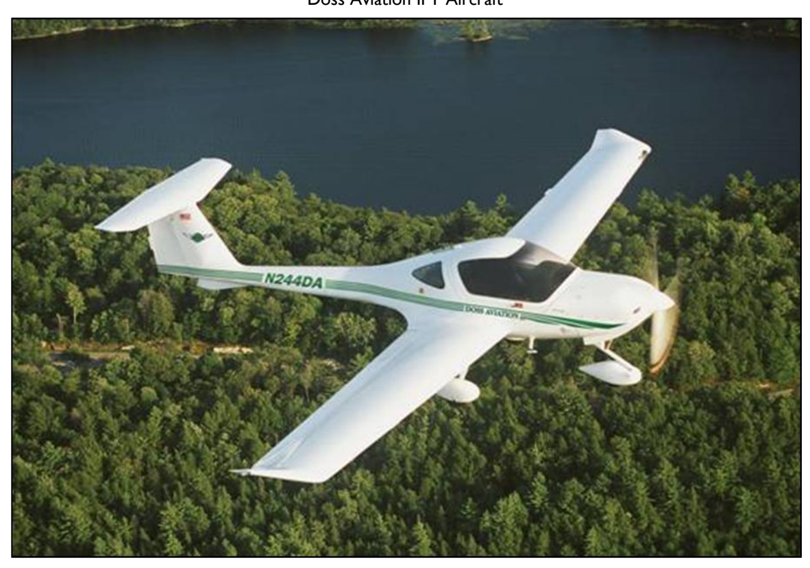
Figure A-I. Diamond DA20-CI

Doss Aviation operates Diamond DA20-C1 aircraft (see Figure A-1) to execute the IFT program.