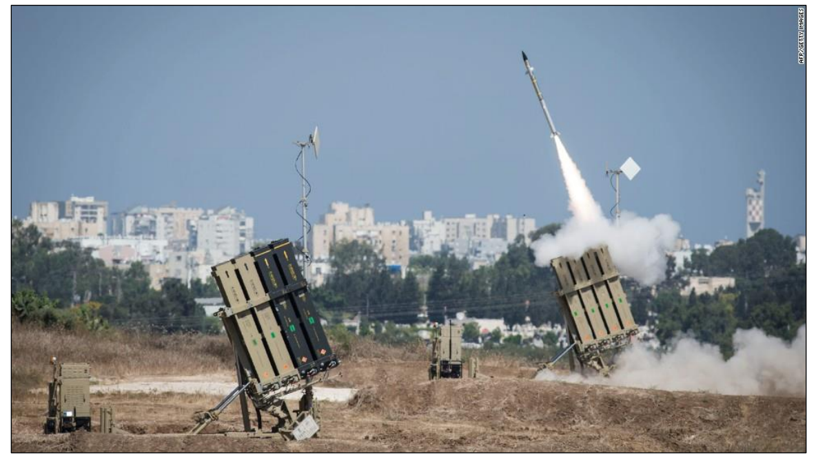
Source: https://www.cnn.com/2014/07/09/world/meast/israel-palestinians-iron-dome/index.html, accessed June 23, 2020.