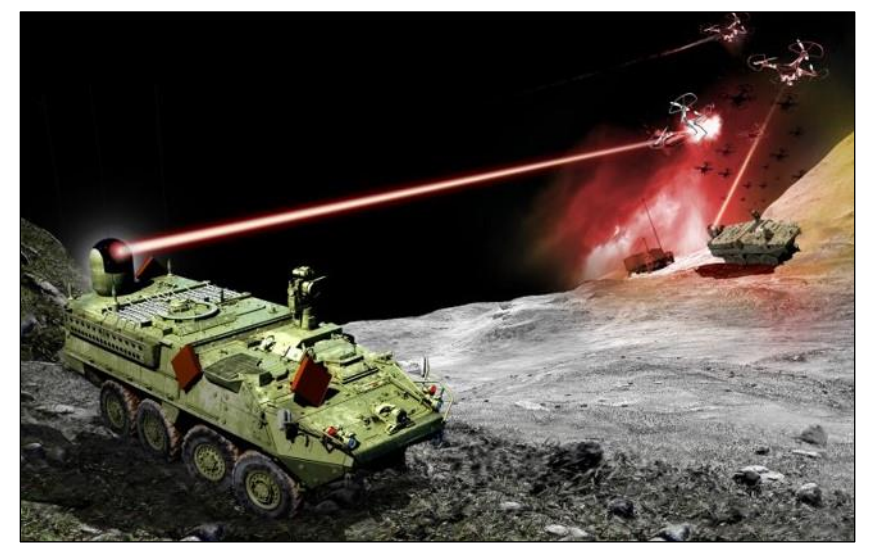
Figure 10.Artist's Conception: Directed Energy (DE) M-SHORAD