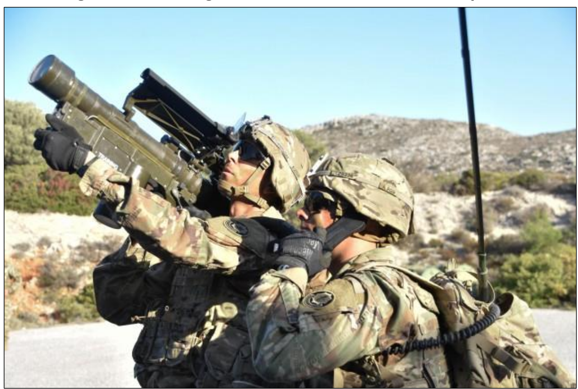
Figure 1. FIM-92 Stinger Man-Portable, Air Defense Missile System

The Army noted that it had "drifted away from the FIM-92 Stinger," which has been in service since the late 1970s, as it focused on counterinsurgency tactics. As an interim solution to the identified lack of SHORAD, the Army developed a pilot course in late 2017 focused on creating two-man Stinger teams for units rotating into Germany or Korea. Since 2017, a number of brigades have sent soldiers through the pilot course and an enhanced five-week course.