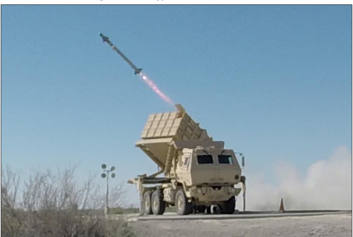
Figure 6. Prototype IFPC Inc 2 Launcher