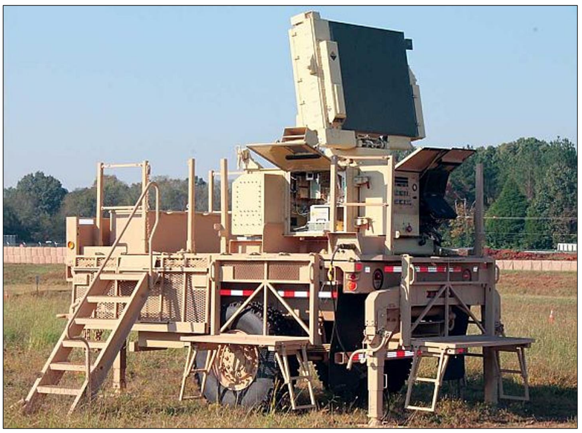
Source: https://www.militaryaerospace.com/unmanned/article/16722055/thalesraytheon-to-build-50-anmpq64-enhanced-sentinel-a3-radar-systems-in-519-million-deal, accessed June 15, 2020.