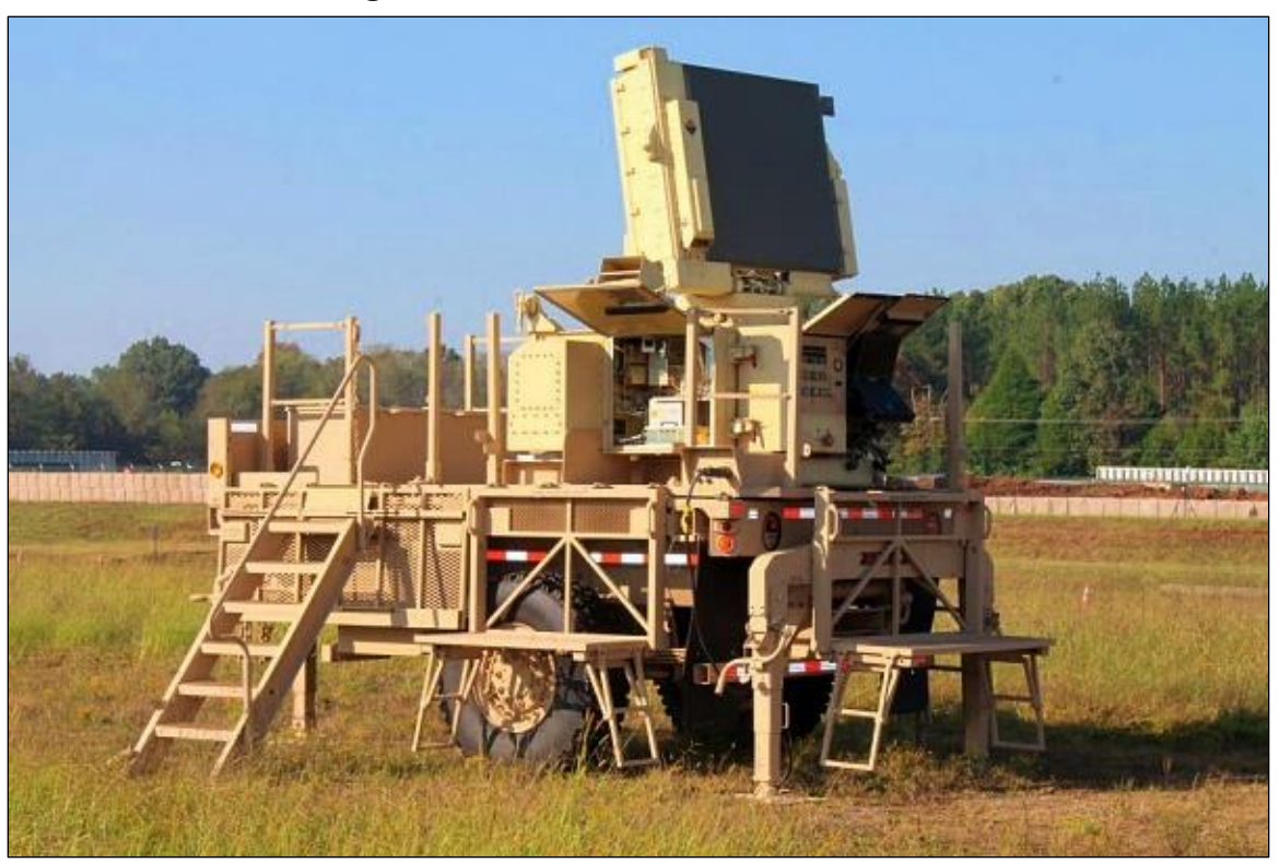
Figure 9.AN/MPQ-64 Sentinel A4 Radar