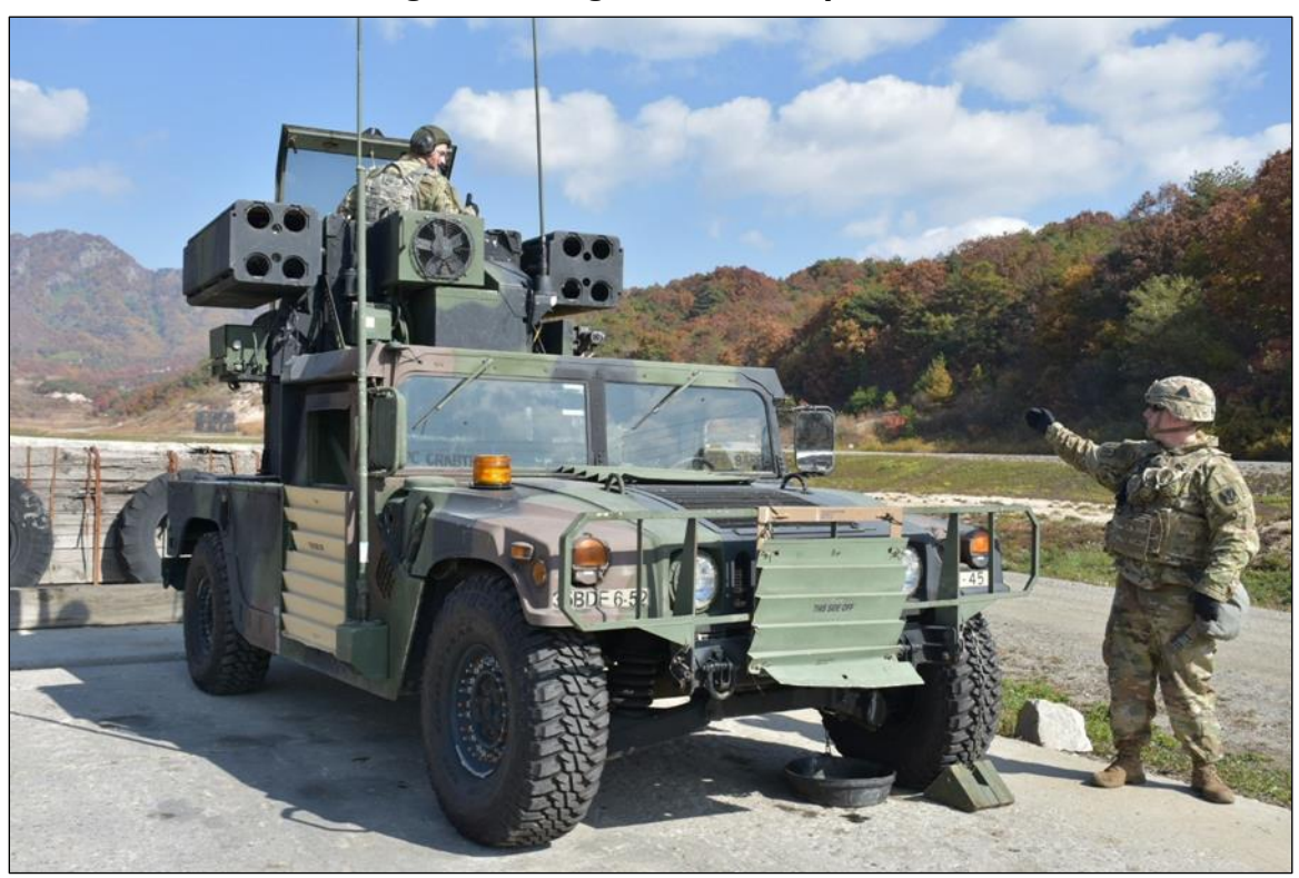
Figure 2.Avenger SHORAD System

In addition to the battalion in Germany, the active Army also has four separate Avenger batteries: one in South Korea; one at Fort Sill, OK; one at Fort Campbell, KY; and one with the Global Response Force at Fort Bragg, NC.