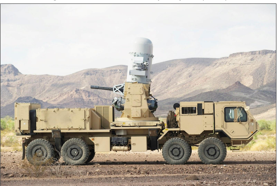
Figure 3.Land-Based Phalanx Weapons System (LPWS)

According to the Army, the LPWS is combat proven and has achieved more than 450 successful intercepts of a rocket or mortar round fired at high-value assets.<sup>15</sup> LPWS 20mm Gatling guns have a 2 kilometer range, and the system has built-in engagement features designed to avoid fratricide (see Figure 3 ). It also has integrated search and track radars and employs a Forward Looking Infrared Radar (FLIR) for target classification. The LPWS can be linked to the Sentinel radar to detect incoming threats.