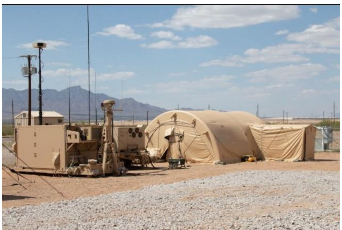
Figure 8.Integrated Air and Missile Defense Battle Command Systems (IBCS)