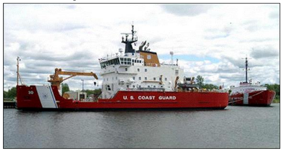
Figure C-I. Great Lakes Icebreaker Mackinaw