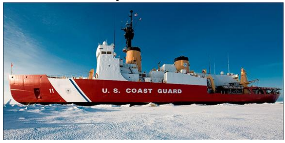
Figure A-2. Polar Sea

Source: Coast Guard photograph that was accessed April 21, 2011, at http://www.uscg.mil/pacarea/cgcpolarsea/img/PSEApics/FullShip2.jpg (link no longer active). The photograph accompanies Associated Press, "Reprieve for Seattle-Based Icebreaker Polar Sea," KOMO News, June 15, 2012, posted at https://komonews.com/news/local/reprieve-for-seattle-based-icebreaker-polar-sea.