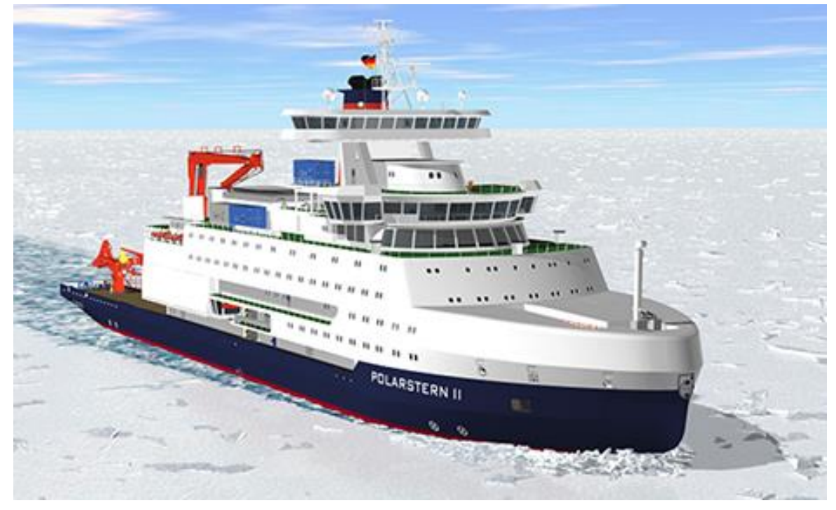
Figure 6. Rendering of SDC Concept Design for Polarstern II

The German icebreaker design referred to in Halter Marine's press release, Polar Stern II (also spelled Polarstern II ) ( Figure 6 ),<sup>30</sup> is to be built as the replacement for Polarstern , Germany's current polar research and supply icebreaker.<sup>31</sup>