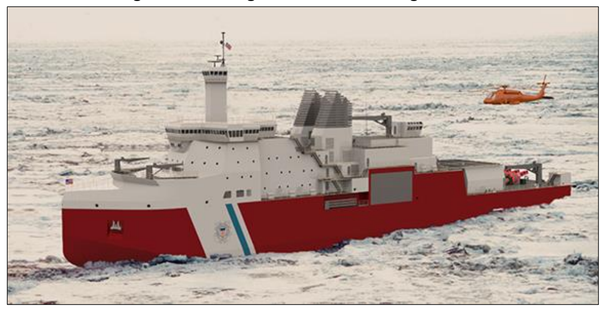
Figure 4. Rendering of Halter Marine Design for PSC

A similar image was included in Halter Marine press release, "VT Halter Marine Awarded the USCG Polar Security Cutter," May 7, 2019, accessed May 8, 2019, at http://www.vthm.com/public/files/20190507.pdf.