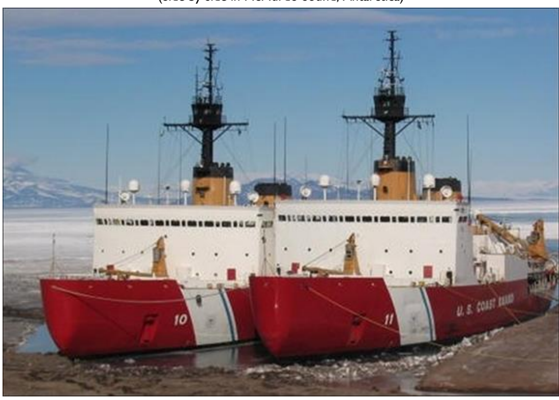
Figure A-I. Polar Star and Polar Sea (Side by side in McMurdo Sound, Antarctica)

Polar Star (WAGB-10) and Polar Sea (WAGB-11), <sup>82</sup> sister ships built to the same general design ( Figure A-1 and Figure A-2 ), were acquired in the early 1970s as replacements for earlier U.S. icebreakers. They were designed for 30-year service lives, and were built by Lockheed Shipbuilding of Seattle, WA, a division of Lockheed that also built ships for the U.S. Navy, but which exited the shipbuilding business in the late 1980s.