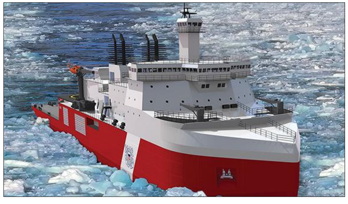
Figure 5. Rendering of Halter Marine Design for PSC

Source: Technology Associates, Inc. (cropped version of rendering posted at http://www.navalarchitects.us/pictures.html, accessed June 10, 2020). A similar image was included in Halter Marine press release, "VT Halter Marine Awarded the USCG Polar Security Cutter," May 7, 2019, accessed May 8, 2019, at http://www.vthm.com/public/files/20190507.pdf.