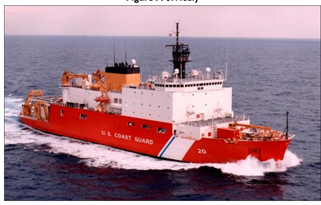
Figure A-3. Healy

Healy (WAGB-20) ( Figure A-3 ) was funded in the early 1990s as a complement to Polar Star and Polar Sea , and was commissioned into service on August 21, 2000.