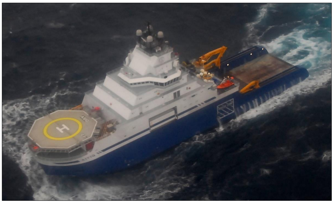
Figure A-8. Commercial Ship Aiviq

Source: Cropped version of photograph accompanying "Aiviq," Wikipedia, accessed April 29, 2022, which states that the photograph is dated December 30, 2012, and credits the photograph to U.S. Coast Guard Petty Officer 3<sup>rd</sup> Class Chris Usher.