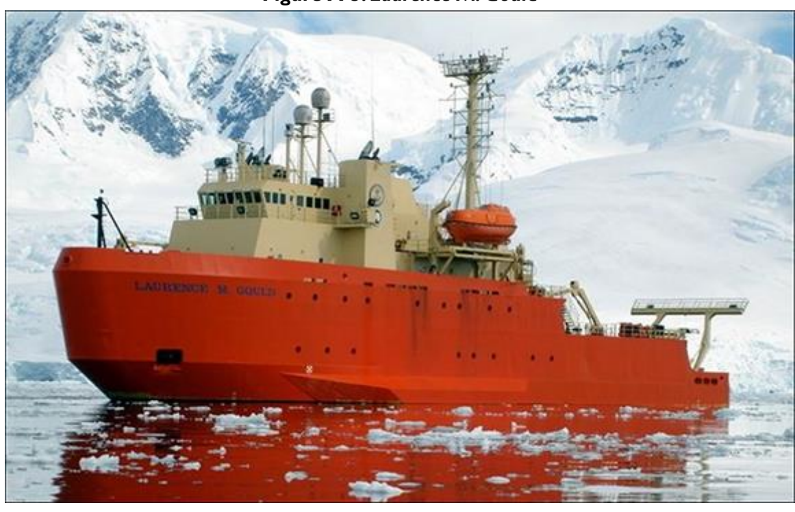
Figure A-5. Laurence M. Gould

Like Palmer , the polar research and supply ship Laurence M. Gould ( Figure A-5 ) was built for NSF by North American Shipping. It was completed in 1997 and is operated for NSF on a long-term charter from ECO. It is 230 feet long and has a displacement of about 3,800 tons. It has a crew of 16 and can embark a scientific staff of 26 to 28 (with a capacity for 9 more in a berthing van). It can break ice up to 1 foot thick with continuous forward motion. Like Palmer , it was built to support NSF operations in the Antarctic, particularly operations at Palmer Station on the Antarctic Peninsula.