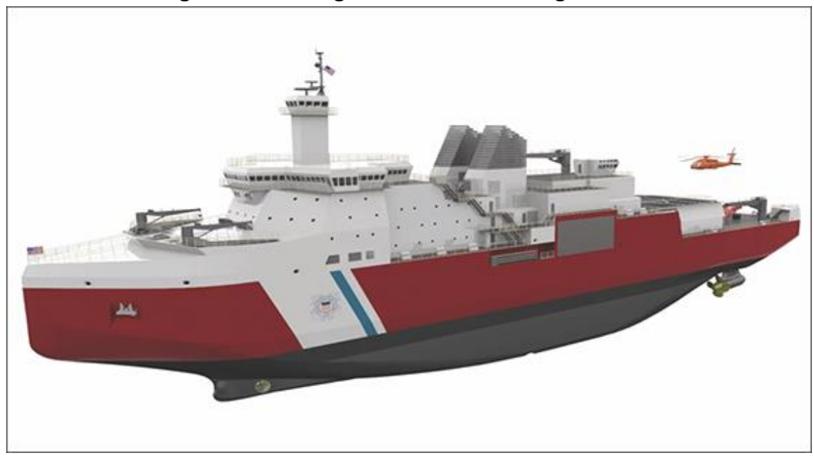
Figure 1. Rendering of Halter Marine Design for PSC

Source: Illustration accompanying Sam LaGrone, "UPDATED: VT Halter Marine to Build New Coast Guard Icebreaker," USNI News, April 23, 2019, updated April 24, 2019. The caption to the illustration states "An artist's rendering of VT Halter Marine's winning bid for the U.S. Coast Guard Polar Security Cutter. VT Halter Marine image used with permission."