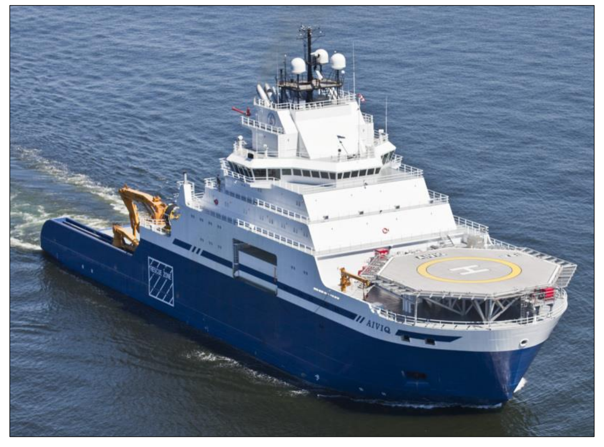
Figure A-7. Commercial Ship Aiviq

a large part of the 2022/23 shipping season, with RSV Nuyina's return from maintenance delayed due to a delay in receiving spare parts. 92 ( Nuyina is an Australian Antarctic icebreaker.)