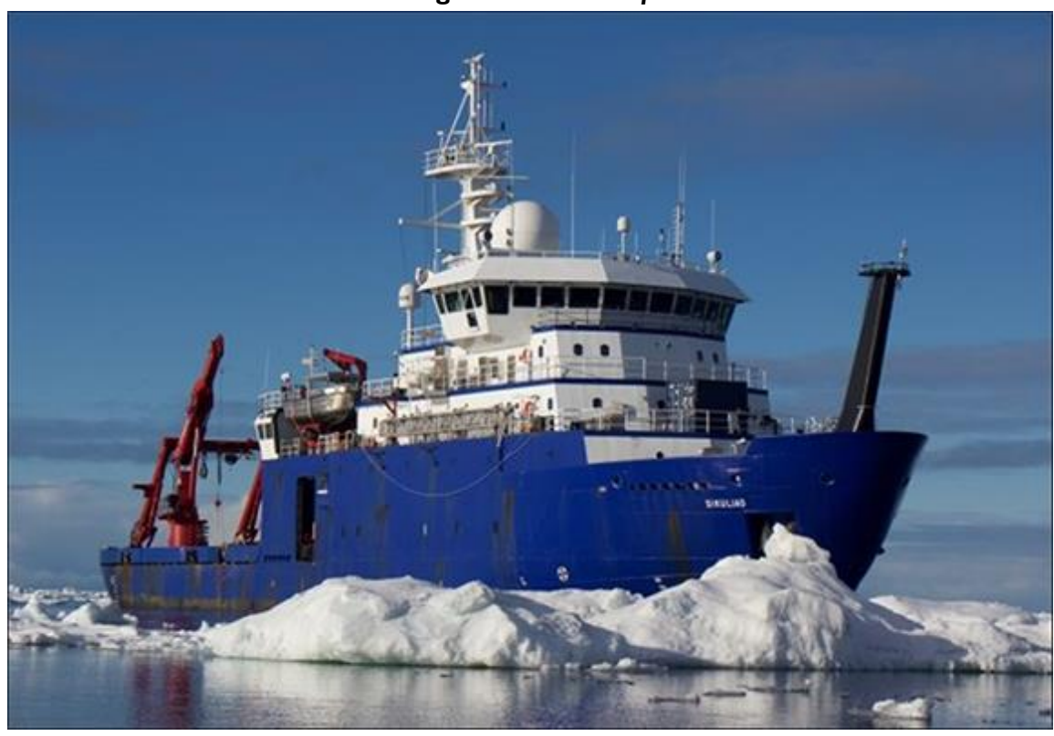
Figure A-6. Sikuliag

Sikuliaq (see-KOO-lee-auk; Figure A-6 ), which is used for scientific research in polar areas, was built by Marinette Marine of Marinette, WI, and entered service in 2015. It is operated for NSF by the College of Fisheries and Ocean Sciences at the University of Alaska Fairbanks as part of the U.S. academic research fleet through the University National Oceanographic Laboratory System (UNOLS). Sikuliaq is 261 feet long and has a displacement of about 3,600 tons. It has a crew of 22 and can embark an additional 26 scientists and students. The ship can break ice 2½ or 3 feet thick at speeds of 2 knots. The ship is considered less an icebreaker than an ice-capable research ship.