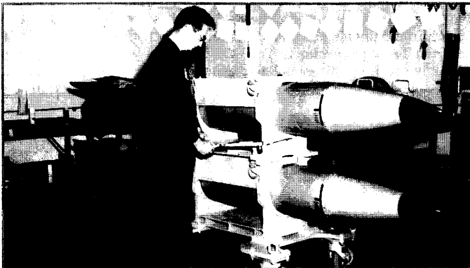
HEU is required for nuclear weapons. Pictured is a Pantex Plant worker preparing to disassemble nuclear weapons.