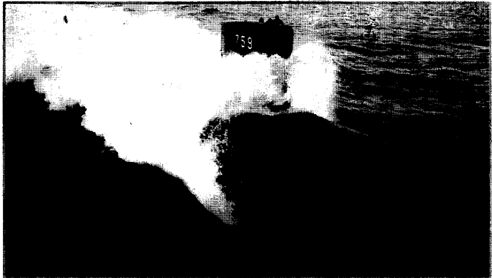
All U.S. nuclear-powered warships currently use reactors fueled by HEU. Pictured is the U.S.S. Jefferson City (SSN 759), a Los Angeles-Class Attack Submarine.