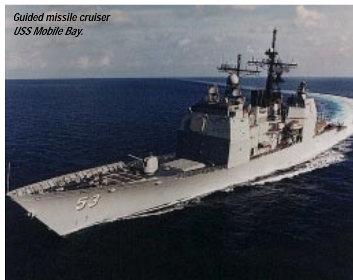
Guided missile cruiser USS Mobile Bay.

An array of service programs reinforces the joint and combined nature of the TMD mission. The TMD Initiative (TMDI) involves the Army, Navy, and Air Force. 10 The