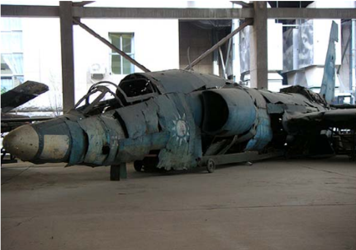
Figure 3. Wreckage of a U2 Aircraft with ROC markings in the Beijing Military Museum.

Although Chinese research and development efforts in the 1960s focused on so-called “sophisticated technologies” like nuclear weapons and ballistic missiles, the development of highly capable air defenses based on the Soviet SA-2 surface-to-air missile (SAM) and its associated radar systems was a close second in terms of priority for early Chinese weaponeers. 363 The Chinese produced an indigenous version of the SA-2 called the HQ-1. The PRC placed significant priority on modifying the HQ-1 to shoot-down U2 high-altitude reconnaissance aircraft operated by Taiwan during the 1960s. Chinese weaponeers created the HQ-2, a larger version of the HQ-1, which was capable of negating the U2's high altitude and electronic countermeasures. Before the program was terminated in 1974, China succeeded in downing at least four U2 aircraft, one of which is displayed in the Beijing Military museum. China also authorized the development of another missile, the HQ-3, to target the U.S. SR-71 aircraft, but flight-testing was unsuccessful. 364