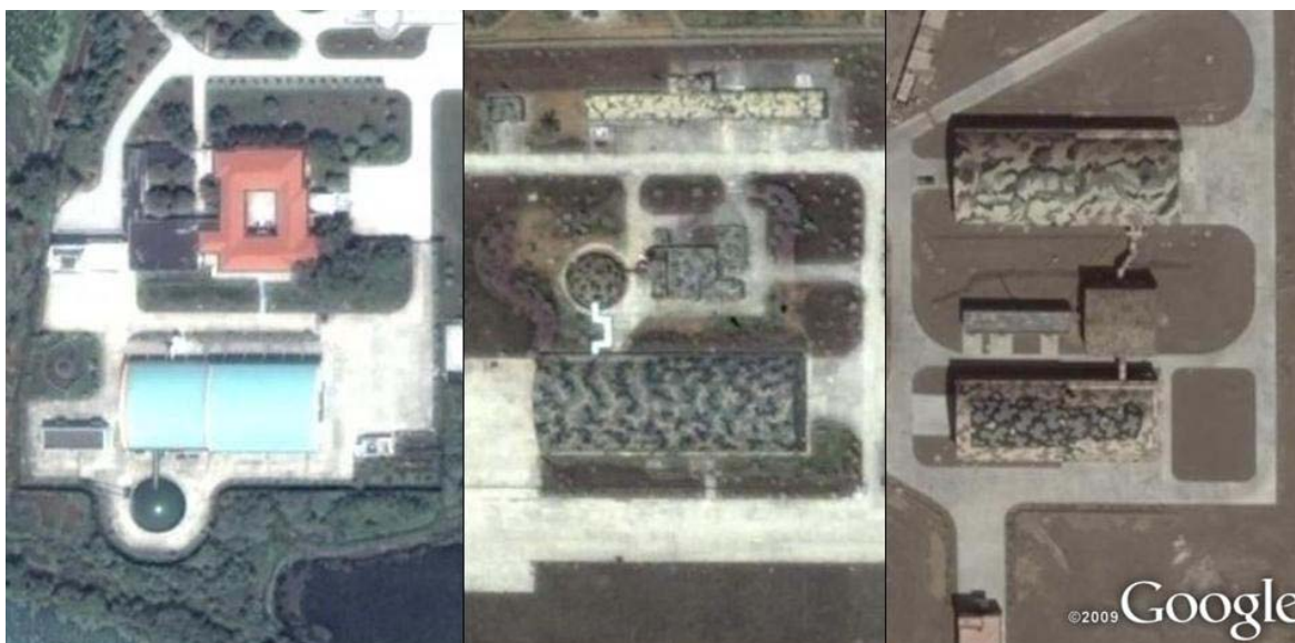
AIOFM - Hefei