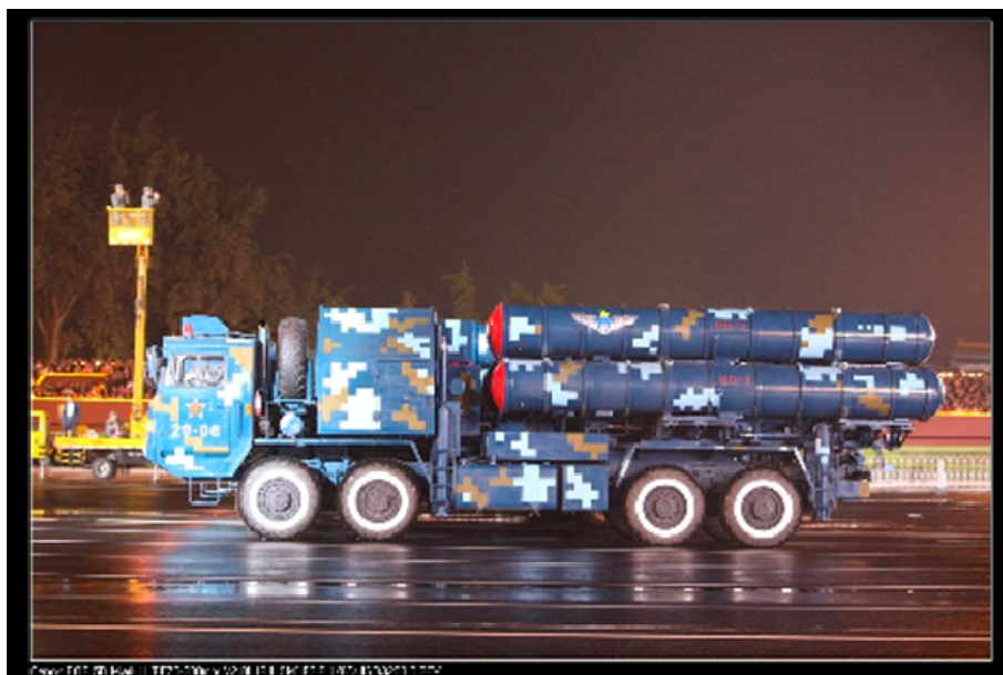
Figure 6. Chinese HQ-9 surface-to-air missile.