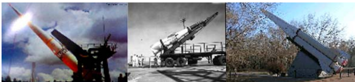
Figure 4. From left to right: Chinese Fanji, US Sprint, Russian Galosh ABM interceptors.