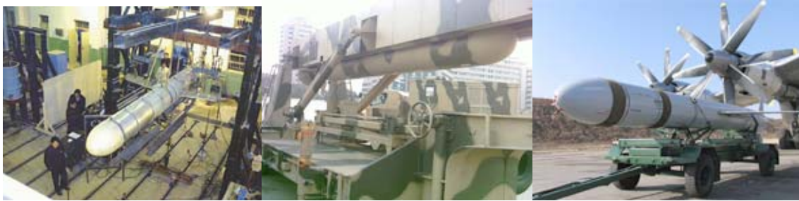
Figure 2. From left to right: A possible Chinese DH-10 LACM; Pakistani Babur LACM, Russian AS-15 Kent (KH-55) LACM.

China included a block of DH-10 launchers in its 2009 National Day Parade. Each launcher carries three tubes for missiles. By 2009, China had approximately 150-350 DH-10 missiles and 40-55 launchers.