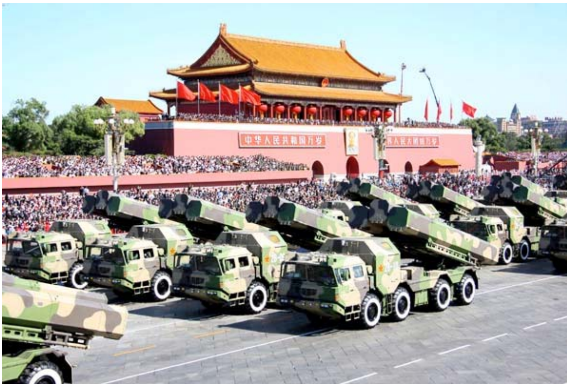
Figure 1. Chinese DH-10 Land Attack Cruise Missiles on parade in 2009.

digital maps. 338 Today, certain cruise missiles can use satellite navigation to achieve even better accuracy in flight.