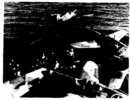
ARMY P-40 Warhawk fighter catapults from the deck of a Sangamon class to North Africa.

use her battery and equipment . . . . . The service experience necessary to test many of the questionable features of the ship's design was soon obtained in a wintry gale encountered en route to Bermuda. The two forward boats were carried away, the new upper decks proved to be sieves and the repair work of the ship's force got underway in earnest."