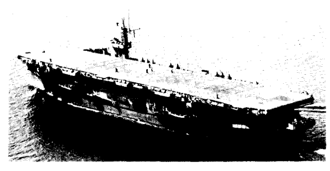
BOGUE CLASS escort carriers were products of the 1942 shipbuilding program. They were converted from Maritime Commission C-3 hulls.