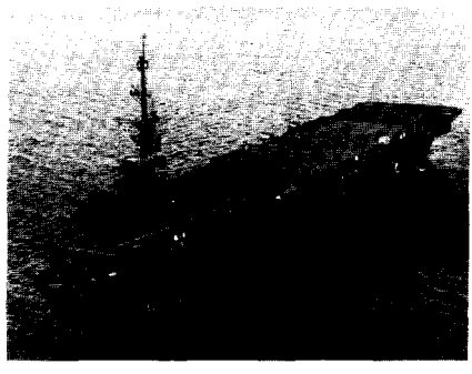
COMMENCEMENT BAY class was concerned to provide trans-ocean convoys with air cover.

The first of these, USS Casablanca (CVE-55), was commissioned July 8, 1943, and gave its name to the class—CVE-55 through CVE-104. They were also referred to as Kaiser class escort carriers. The Kaiser yard completed its 50-ship program on July 8, 1944. This was an impressive achieve-