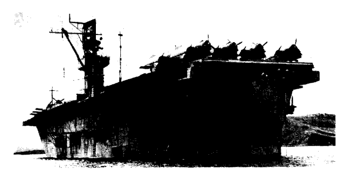
USS SUWANEE was one of four escort carriers converted from Cimmaron class fleet oilers. They were rushed to completion for battle duty.

closer together, opening up larger areas of the North Atlantic for the German subs to search. The Germans solved this problem by developing the "wolf pack" technique of operating in groups, then concentrating for the kill when convoys were sighted.