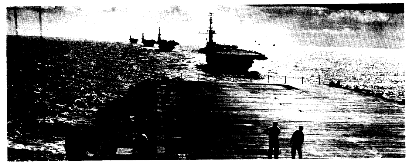
ESCORT CARRIERS file in formation during World War II. Viewed from the Manila Bay (CVE-61) are sister Casablanca class carriers Coral Sea