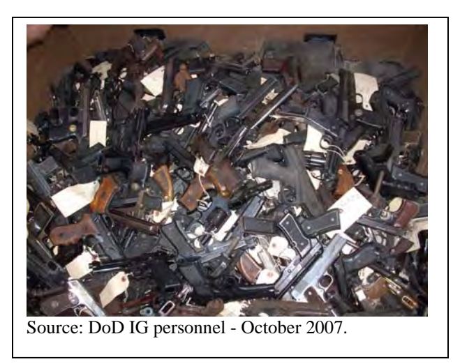
Figure 1. Captured Weapons Stored at Taji National Depot.

MNF-I concurred, noting that in coordination with MNF-I and MNSTC-I, MNC-I published Fragmentary Order (FRAGO) 085 on January 28, 2008. The FRAGO was designed to coordinate the transfer of captured enemy weapons in a controlled and recorded manner between Coalition forces and ISF.