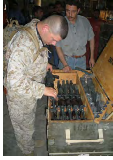
Figure 2. Weapons Inventory

We performed a count of a judgmental sample of weapons serial numbers at BPC, the Taji NAD, and the KMTB Location Command to determine the accuracy of weapons serial numbers recorded on MoD and MoI master inventory Excel spreadsheets.