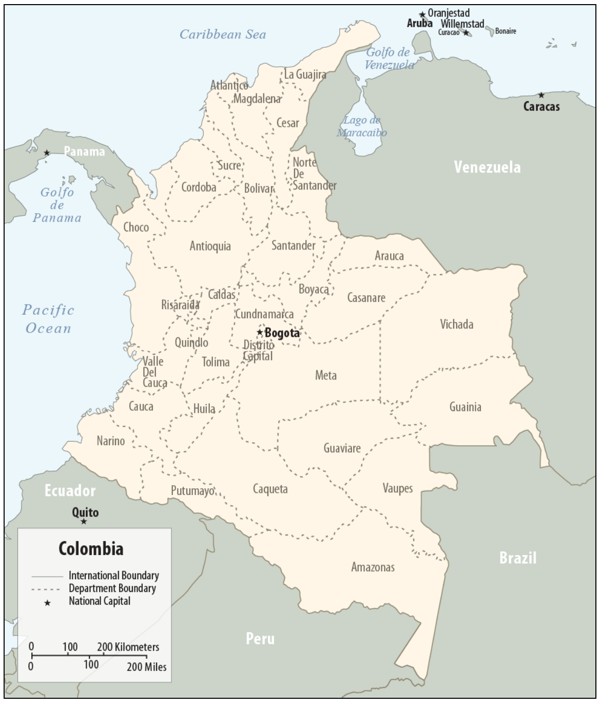
Figure 1. Map of Colombia Showing Departments and Capital