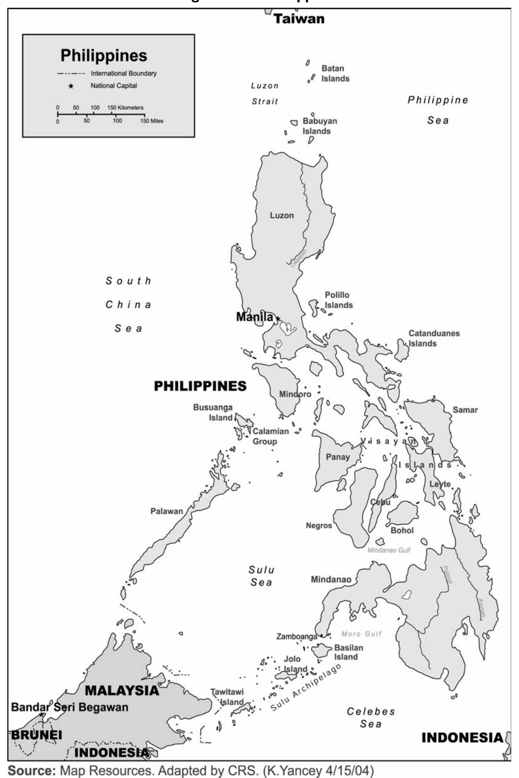
Figure 4.The Philippines