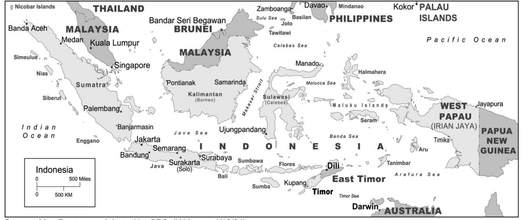
Figure 2. Indonesia