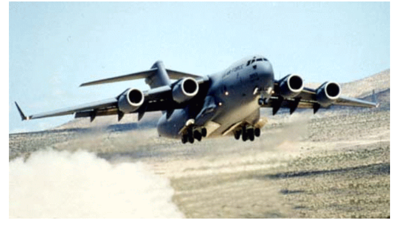
Figure 5. C-17 Globemaster III Taking Off from Unfinished Runway