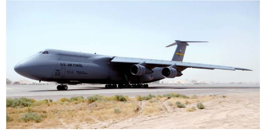
Figure 4. C-5 Galaxy at Balad Air Base, Iraq

Basing. Active duty C-5s are stationed at Dover AFB, DE, and Travis AFB, CA, in associate units teamed with the Air Force Reserve.<sup>151</sup> C-5s are assigned to Reserve units at Lackland AFB, TX; Westover Air Reserve Base, MA; and Wright-Patterson AFB, OH, and to Air National Guard (ANG) units at Martinsburg ANGB, WV; Memphis, TN; and Stewart ANGB, NY.<sup>152</sup>