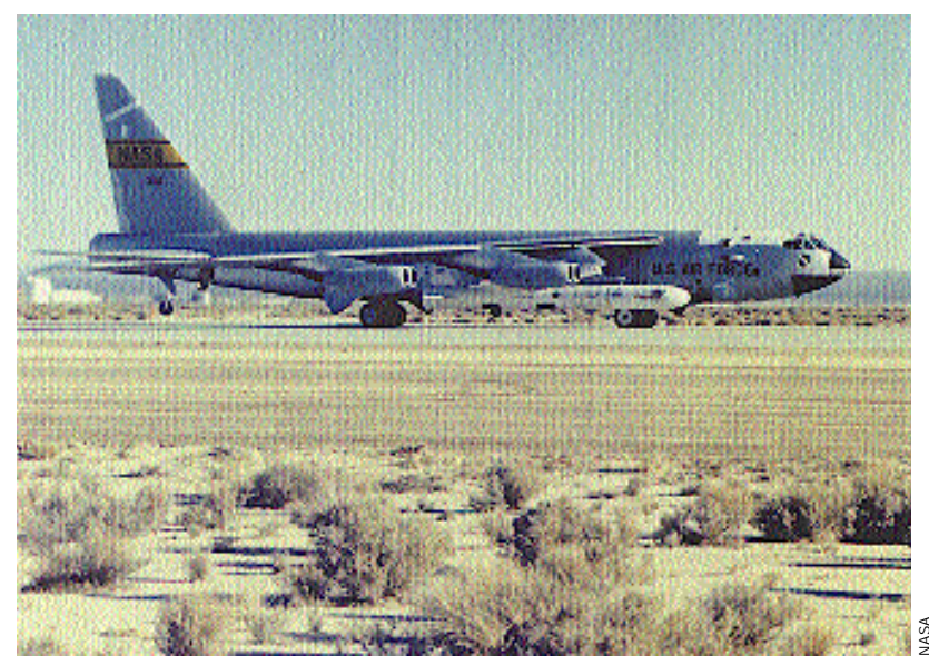
Pegasus air-launch space booster on board NASA B–52 carrier aircraft.

Desert Storm was that, in general, the Air Force and Navy manned systems while the Army and Marine Corps armed men. As lethality increased in the Gulf War with the M1–A1 Abrams tank and advanced helicopter armed with precision guided missiles able to kill armor and weapons systems outside engagement ranges, even the Army and